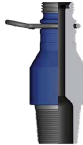
Rotary threads manufactured in accordance with API Spec 7-2